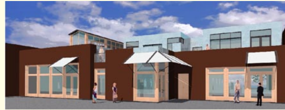
Rear elevation facing the city's main public parking lot