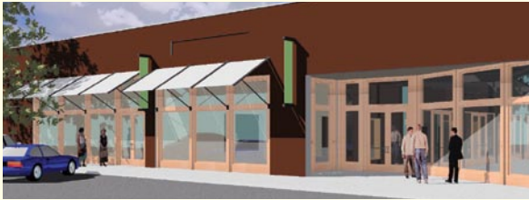
Front elevation on Main Street in Hohenwald, TN

Become a founding supporter by making a donation today!